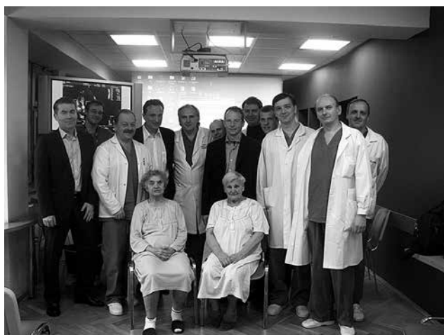
Fig. 1. First TAVI patients with Zabrze TAVI team and Matthias Thielmann (Essen, Germany) as proctor, Zabrze, November 26 th , 2008.

This method however is associated with elevated risk in approximately 1/3 of patients with severe symptomatic AS (40%) [4]. Although operative mortality of SAVR is low in a selective group of elderly patients, it increases with number and severity of co-morbidities [5]. Transcatheter aortic valve implantation (TAVI) constitutes a safe and effective therapeutic alternative for this population. As an innovative, costly method of treatment, it requires however